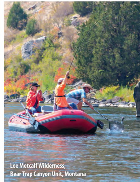
Lee Metcalf Wilderness, Bear Trap Canyon Unit, Montana